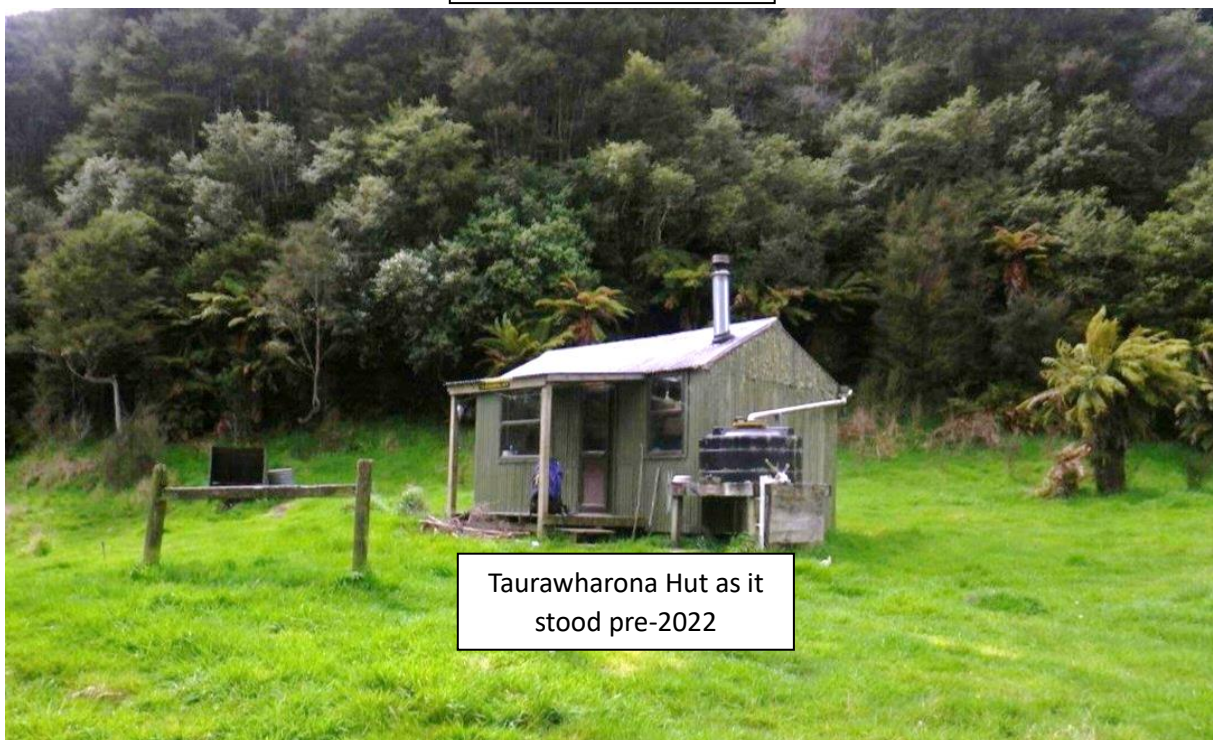
Taurawharona Hut as it stood pre-2022