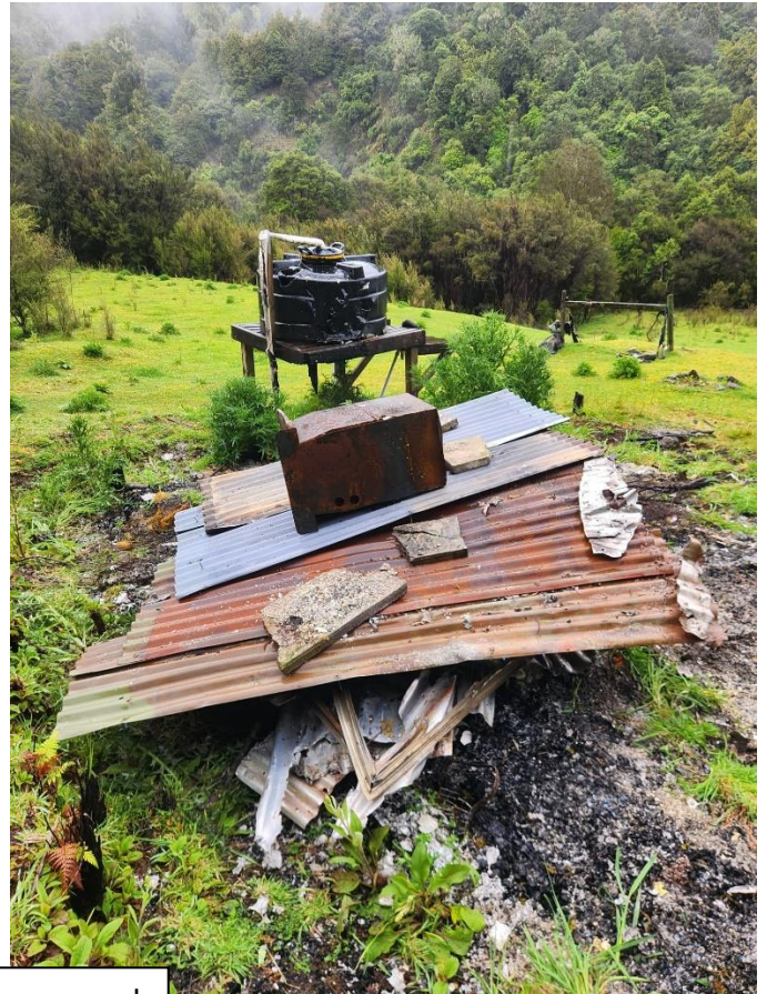
Tidying up the carnage!