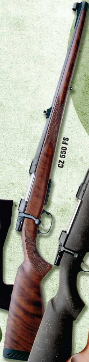
CZ 550 FS