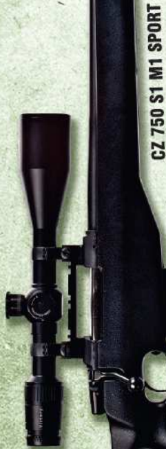
CZ 750 S1 M1 SPORT