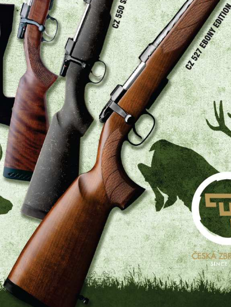
CZ 527 EBONY EDITION