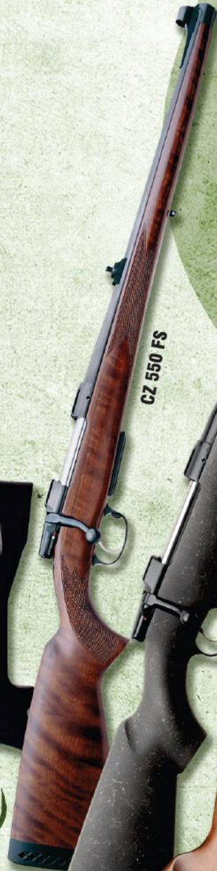
CZ 550 FS