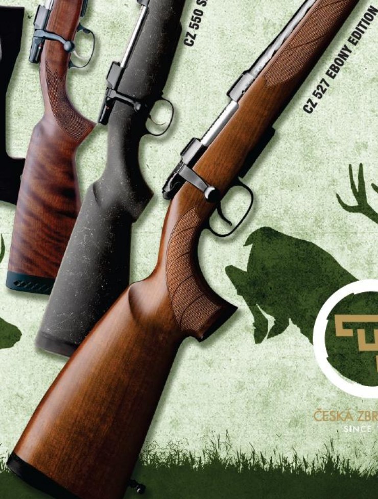
CZ 527 EBONY EDITION