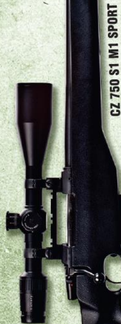
CZ 750 S1 M1 SPORT