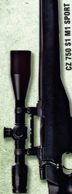
CZ 750 S1 M1 SPORT