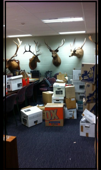
Boxes scattered throughout the National Office to be shifted.

While we are moving offices and setting everything up, everyday business operations will be limited from 25th—1st August. It would be best to contact us by phone, but please bear in mind that from Thursday (28th) until Monday (1st) we will not be online.