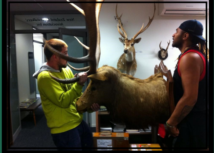
Movers shifting the Red Deer Nitz trophy.