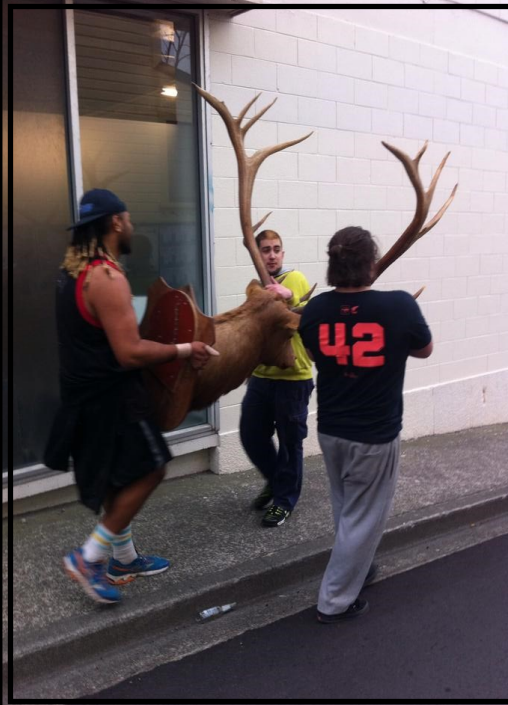
The moving guys shifting the Red Deer Nitz trophy past the main road.