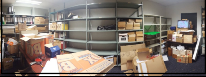
An impressive amount of files boxed up out of our storage room!